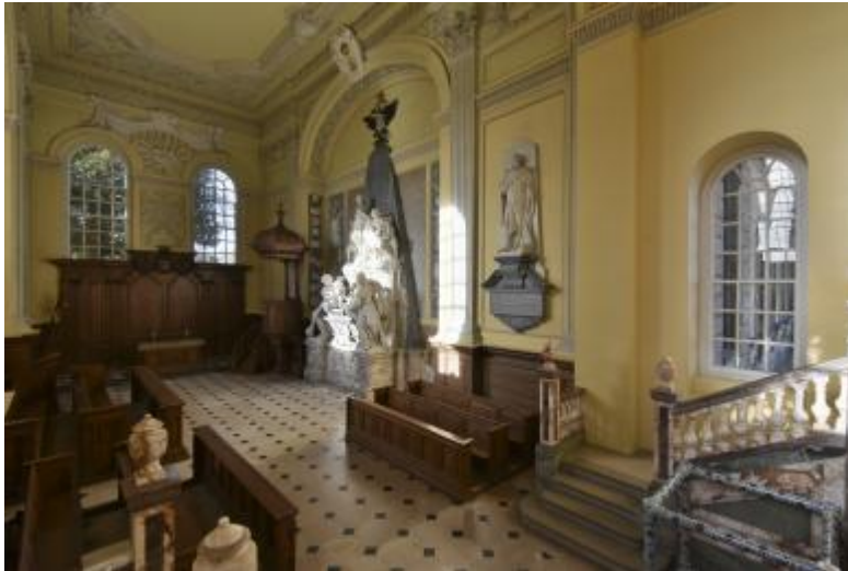
Palace exit via the Chapel.