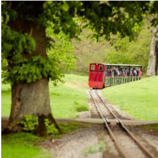
Winston the Miniature train