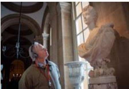
Visitor using the audio guides