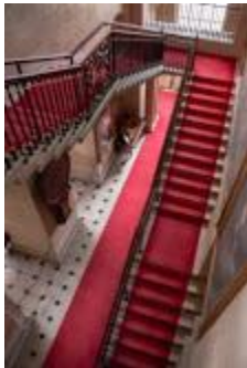
Stairs to The Untold story entrance