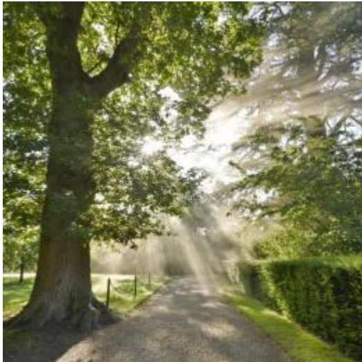
Route to the Cascade