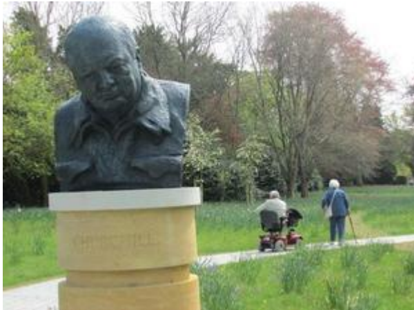
Churchill Memorial Garden