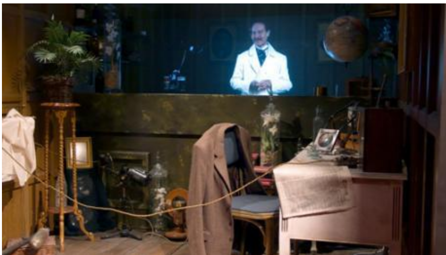
Untold story - flashing lights