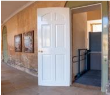
Entrance to the Orangery Lift