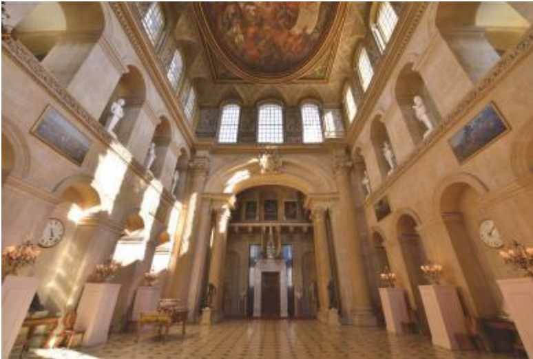
The start of the State room tour in the Great Hall