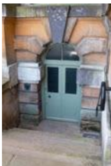
Main entrance to Downstairs Tour

This area is private so there is no toilet facilities or seating during the 50 minute tour and there may be areas of low lighting.