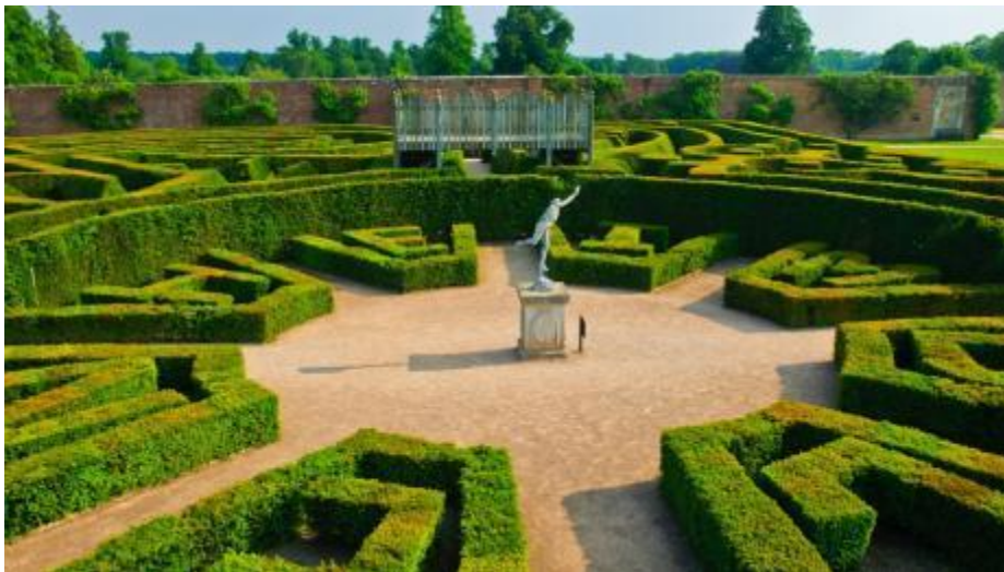
Centre of the Maze