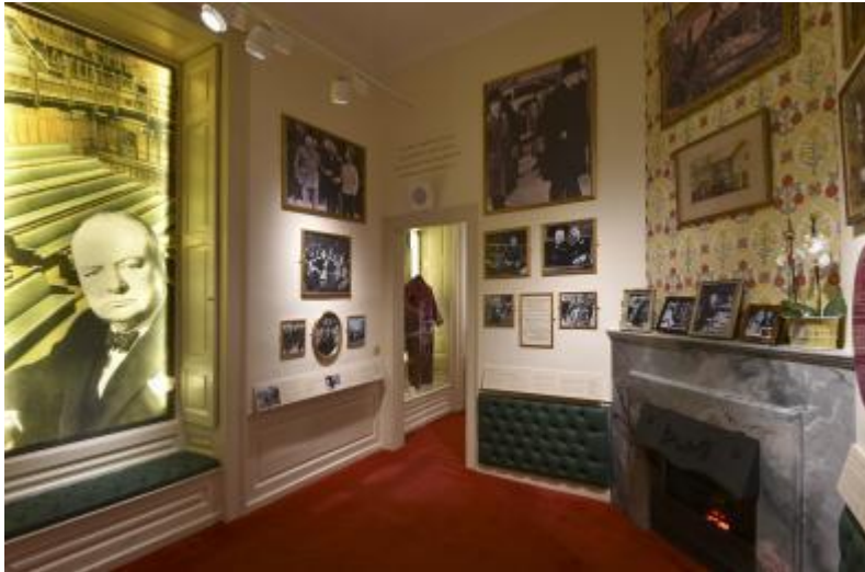
Seating in Churchill Exhibition