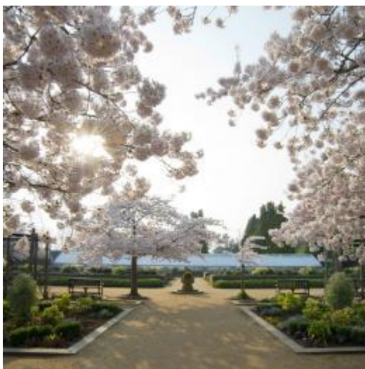
Over looking the Lavender Garden