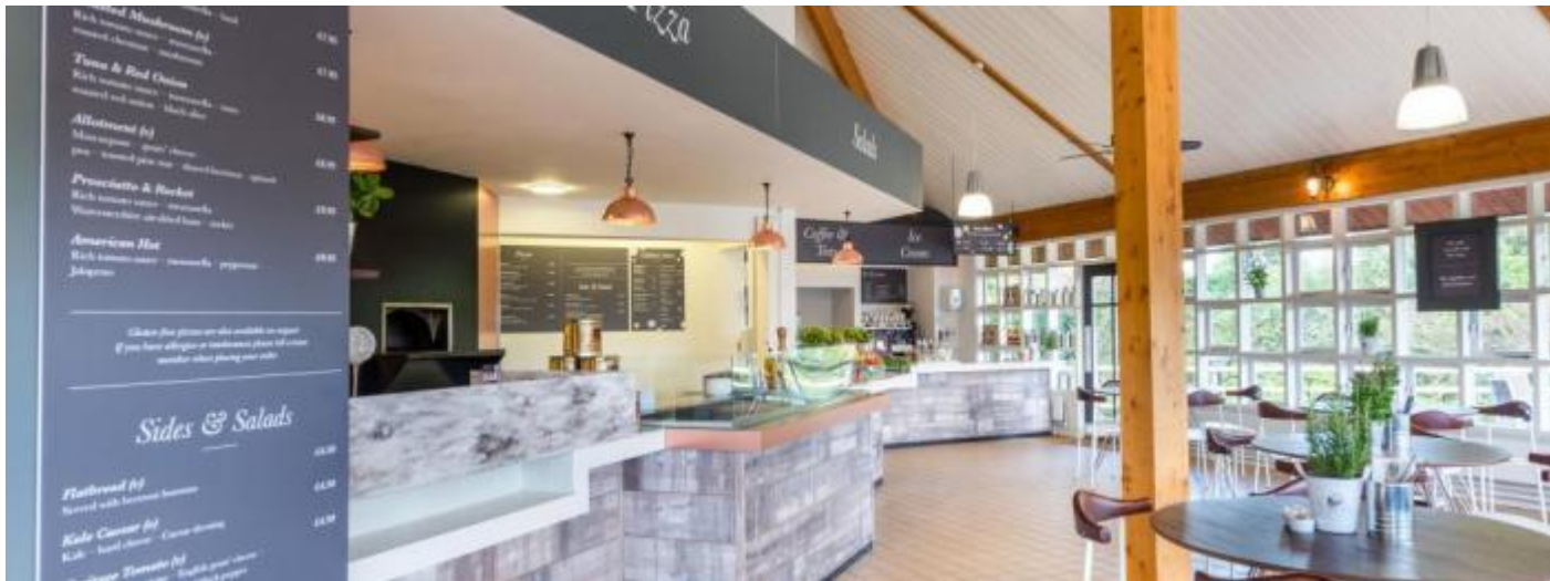
Pleasure Gardens Pizza Cafe

Allergies: If you have any food related allergies please ask the café staff. A full list of ingredients in all the food products is at hand.