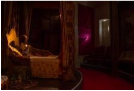
Low light levels in The Untold story