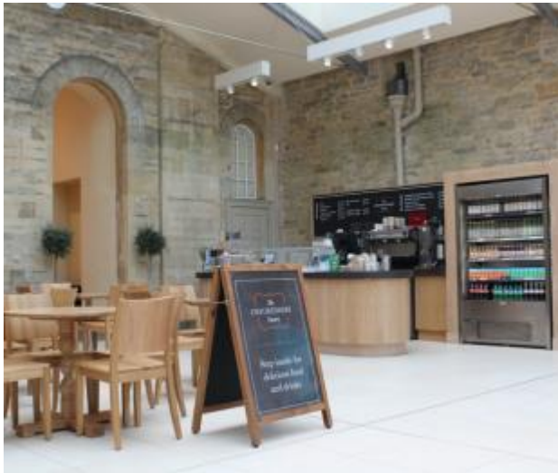
Oxfordshire Pantry cafe

Allergies: If you have any food related allergies please ask the café staff. A full list of ingredients in all the food products is at hand.