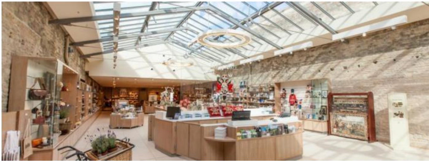
East Courtyard Shop