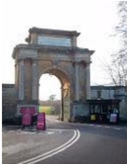
Woodstock gate Kiosk