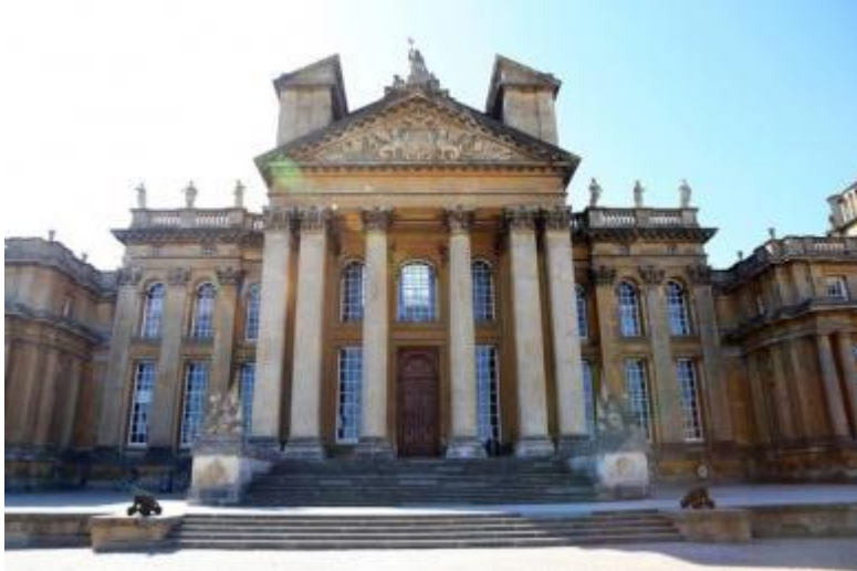
The main entrance to Blenheim Palace