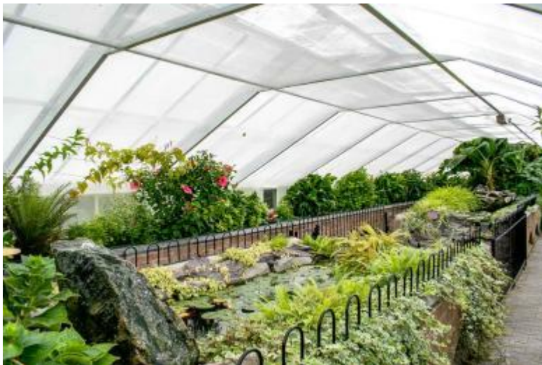
Inside the Butterfly house