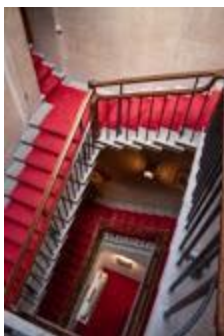
Stairs exiting The Untold story