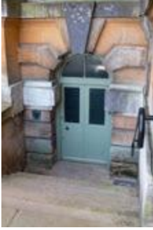
Main entrance to Downstairs Tour