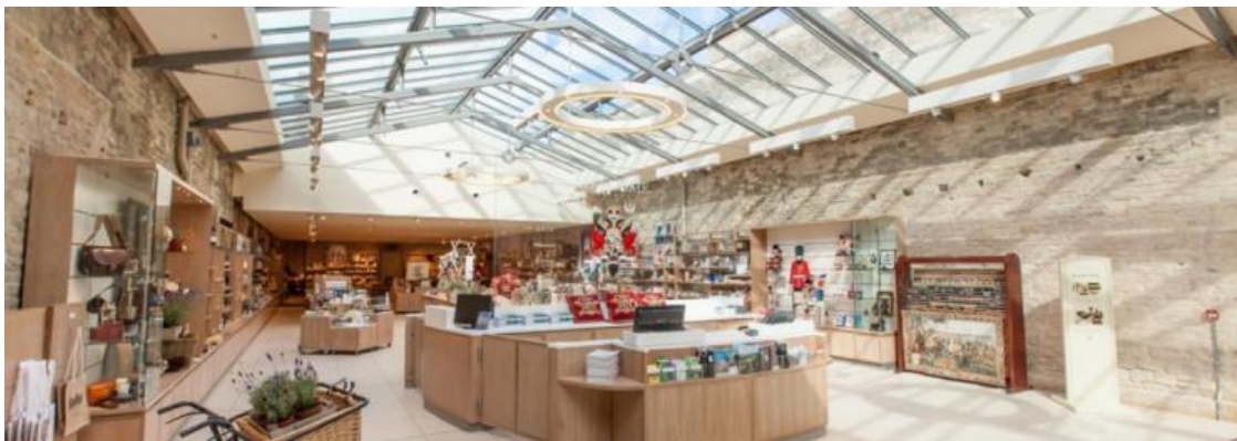
East Courtyard Shop