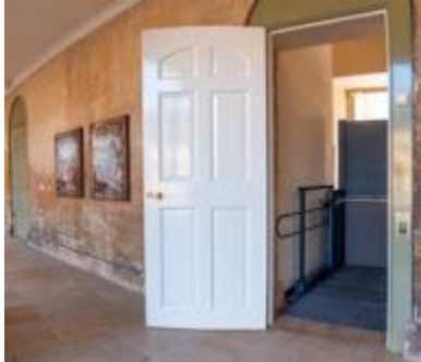
Entrance to the Orangery Lift