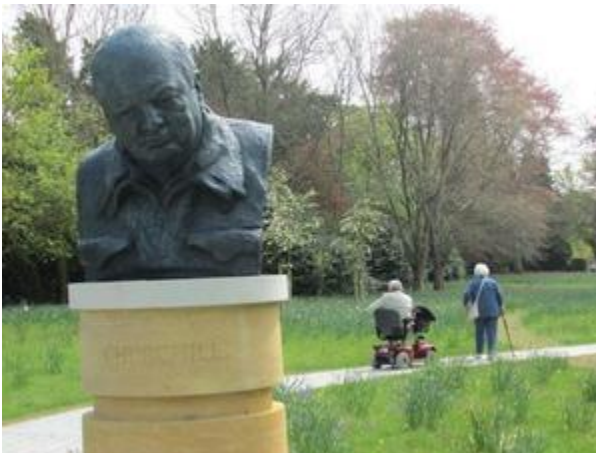
Churchill Memorial Garden