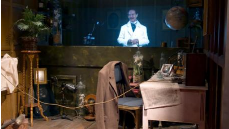
Untold story - flashing lights