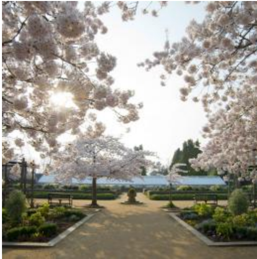
Over looking the Lavender Garden