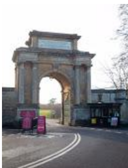
Woodstock gate Kiosk