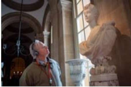
Visitor using the audio guides