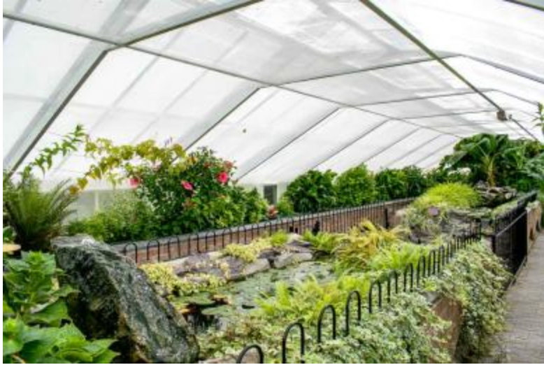
Inside the Butterfly house