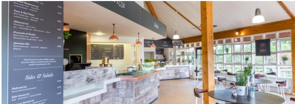
Pleasure Gardens Pizza Cafe