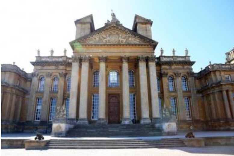
The main entrance to Blenheim Palace