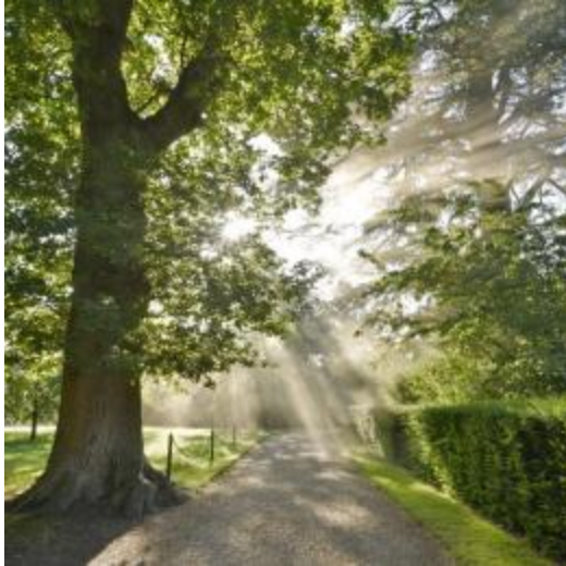
Route to the Cascade