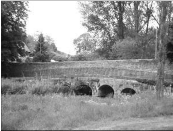
Small bridge with iron railings