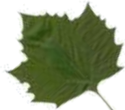
Plane leaf and bark

Find the following words in the word search. They are all types of trees found in the UK:-